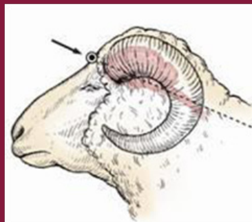
Figure 4 – Frontal method (horned sheep and goats)

When performed on horned sheep or goats from the front (see Figure 4), the gun must be directed at the middle of the forehead just above the level of the eyes and must aim at the spine. This method can only be performed if using the gunshot method.