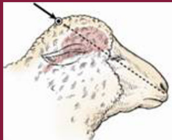
Figure 1 – Poll method (hornless sheep and goats)

When performed on hornless sheep or goats from the poll (see Figure 1), the gun or penetrating captive bolt is directed at the top of the head (poll) and aimed in the direction of the animal's muzzle.