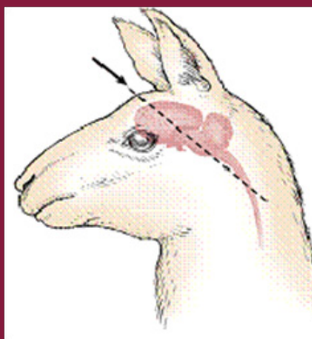
Figure 5 – Llamas and alpacas

When performed on llamas and alpacas (see Figure 5), the gunshot or penetrating captive bolt must be directed at the point of intersection of imaginary diagonal lines from the inside corner of the eye to the base of the opposite ear aiming at the spine.